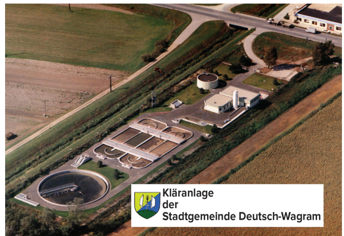
Fig.1: Wastewater Plant at Deutsch-Wagram

A bioaugmentation program was implemented in 1998 for a period of one year to determine if the bioaugmentation program could consistently reduce the amount of sludge generated in the plant. Improving odors and oil and grease breakdown were secondary objectives but were not considered to be enough on their own to justify the cost of product treatment, approximately US $30,000/year.