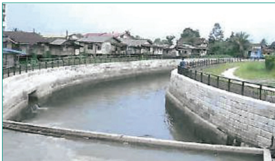
Fig 1 & 2: Pictures of Sg. Bintangor during low-level time prior to treatment in November 2007.

This is a very difficult remediation due to the very high level of contamination and the lack of retention time for biological treatment.