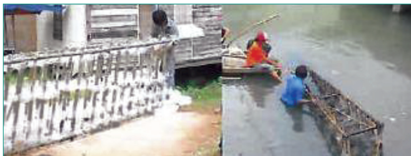
Fig.4: Shows the installation of the bioremediation cages in the river.